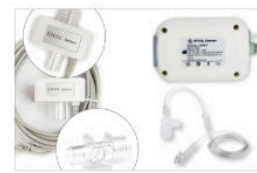
Sidestream / Mainstream ETCO2 Module