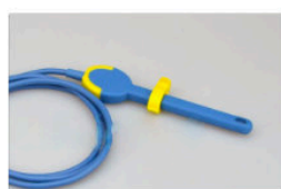
Rectal SpO2/TEMP sensors