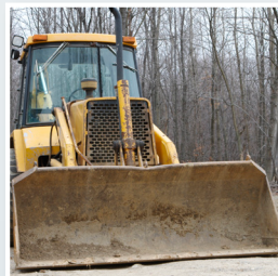
Front End Loaders