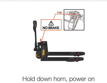
Service Mode Utilise brake release in emergencies