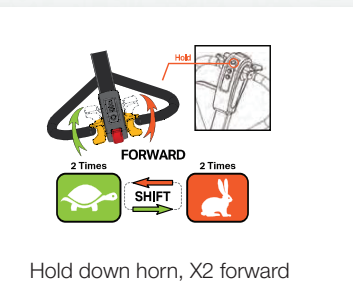
Speed Setting Convenient fast / slow pre-set speeds