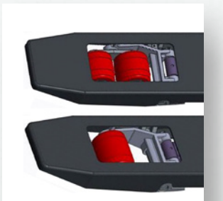
Single / Tandem Load Wheels