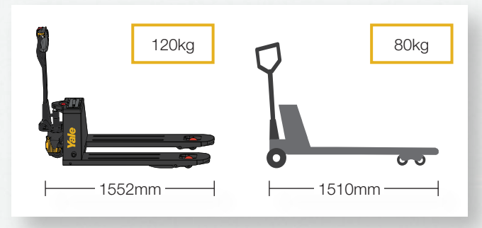
Compact and Lightweight