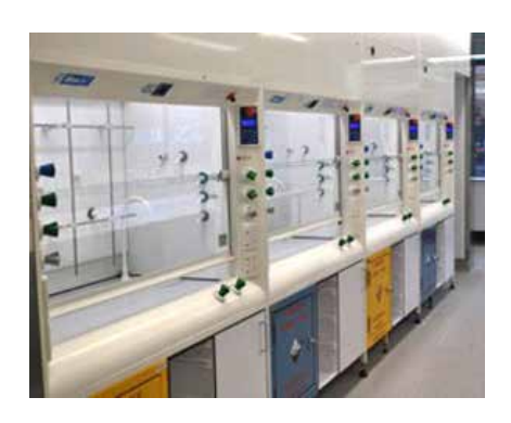
EcoAir® laboratory fume cupboard.

Shown on the right is one of many EcoAir® fume cupboards going into in a new building. This one has the available split sash. Also fitted with an optional EcoSash®, this fume cupboard's Motion Sensor panel is visible above the sash.