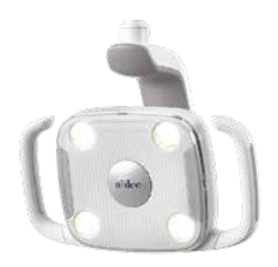
A-dec 300 LED

Place the assistant's clinical devices right where they are needed most. Adjustable 3- or 4-position holders are available as a chair mount, cuspidor mount or telescoping arm.