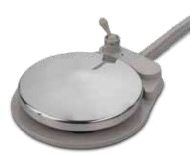
Disc foot control