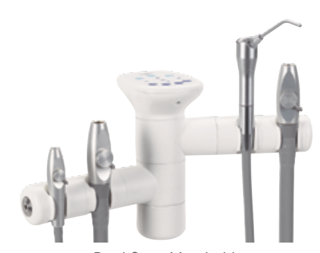
Dual 2-position holder