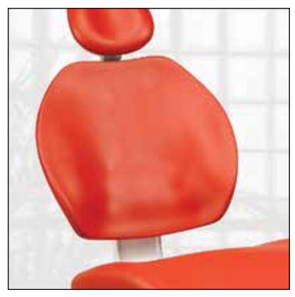
Formed upholstery without armrests