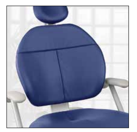
Sewn upholstery with armrests