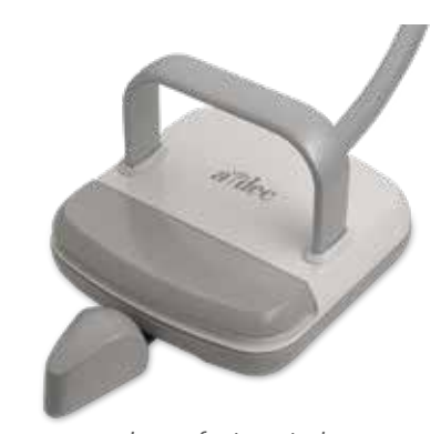
Lever foot control