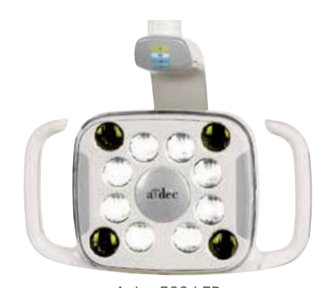
A-dec 500 LED