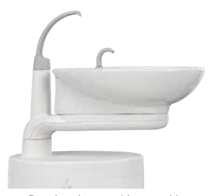
Rotating vitreous china cuspidor