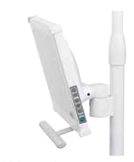
Light monitor mount