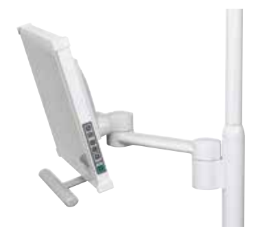
Light monitor mount with link arm