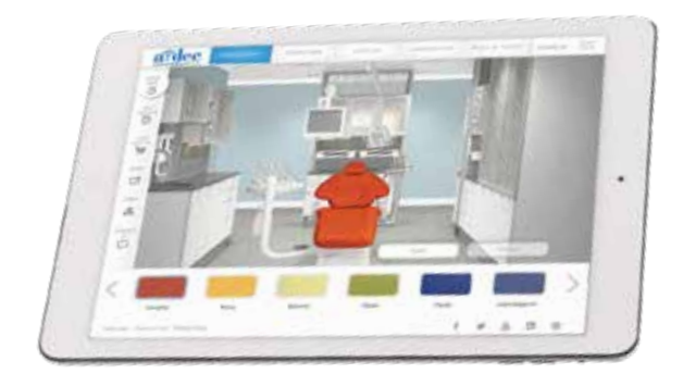
Order Your Samples at a-dec.com/InspireMe

Color makes all the difference in creating an environment that reflects you. That's why A-dec offers a wide variety of colors and selected options to coordinate formed and sewn upholsteries.