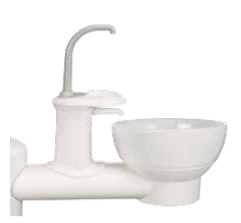
Fixed glass cuspidor