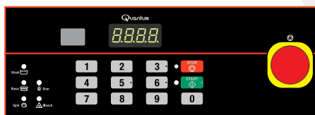
Quantum™ Gold Control