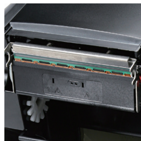
"Twin-Sensor" technology allows you to use a broad range of labels