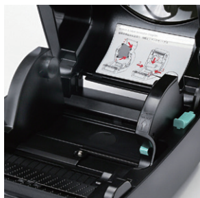
Rod-less label roll holder for easy loading and smooth feeding