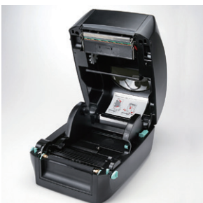
Modern clam-shell design makes it simple to load labels

Advanced multi-purpose 4" desktop printer for light to medium duty applications. With its powerful and reliable features, RT700 is the best choice for retail and industrial applications