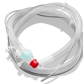
007387 Disposable Pilot Line Circuit with exhalation valve