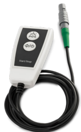
006649 Remote Start Stop w/ Cable