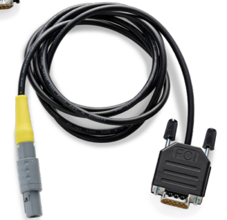
006179 PtcCO 2 cable Sentec