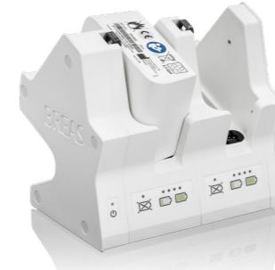
007728/30/32/34 Battery Charger 2 Bank