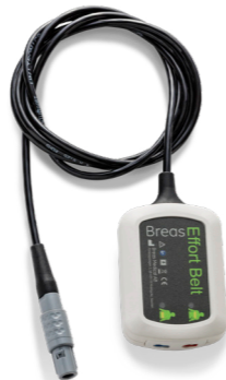
006182 Effort Belt Communication Box