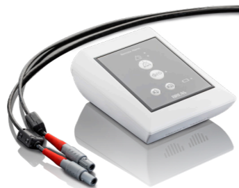
006348 Remote Alarm 10 m cable