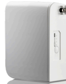
006265 Click-in Battery