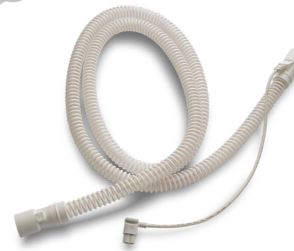
006193 Heated Wire Patient Circuit