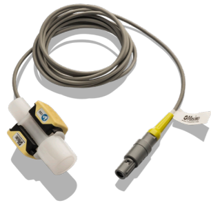
006346 EtCO 2 Sensor