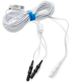
007083 Effort Belts Wire-set, Keyhole connector, 2 Pack