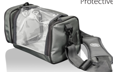
007555 Lightweight Bag