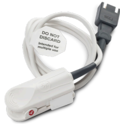
006590 SPO 2 Sensor Pediatric