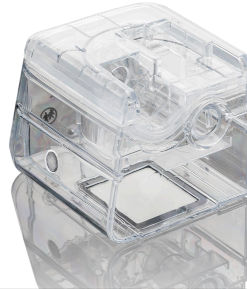
006490 Click-in Humidifier