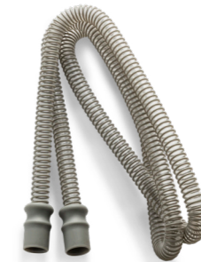
006712 Patient Circuit 15mm x 1.8 meter