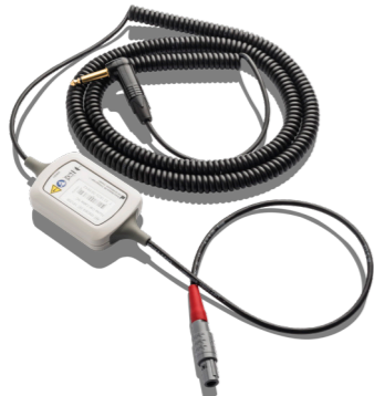
006362-65 Nurse Call Cable