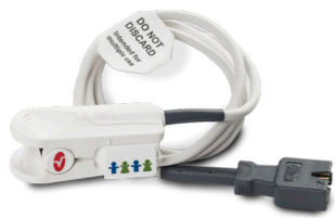
006589 SPO 2 Sensor Adult