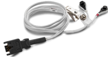
006591 Multisite Sensor