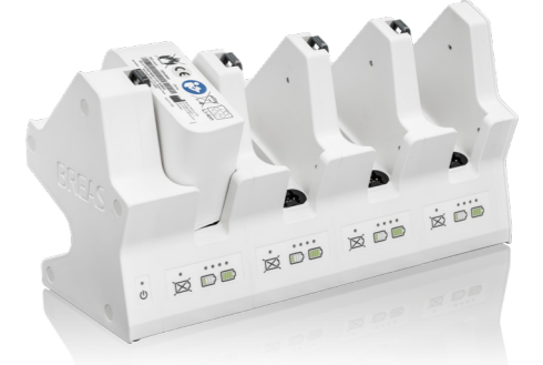
007729/31/33/35 Battery Charger 4 Bank