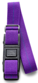
007084 Effort belts, Pediatric, pack of 2 belts