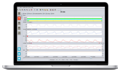
007067 PC Software