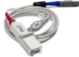
006369 SPO 2 Module