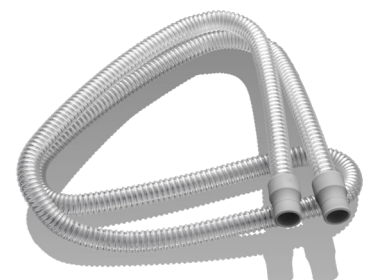
004465 Patient Circuit 22 mm, cleanable