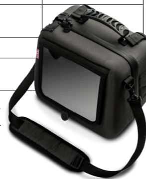
006067 Protective Cover