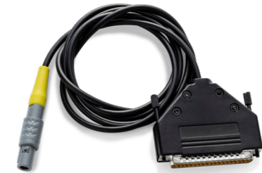
006180 PtcCO 2 cable Radiometer