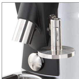
Stainless steel tamper