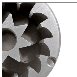
Conical grinding blade

Stainless steel tamper Filter-holder support