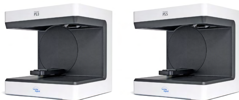
The new laboratory scanners: PS3 and PS5

They are pleasant and simple to use, and combine high precision with true-to-detail scan results. The digital workflow ensures high process reliability, enabling you to save time and benefit from reliable results.