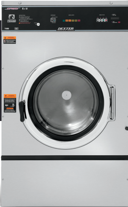
6 Cycle Control