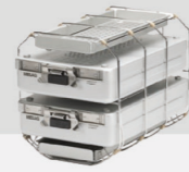
Mount D Plus for 2 MELAstore® Boxes 200 and 2 small trays