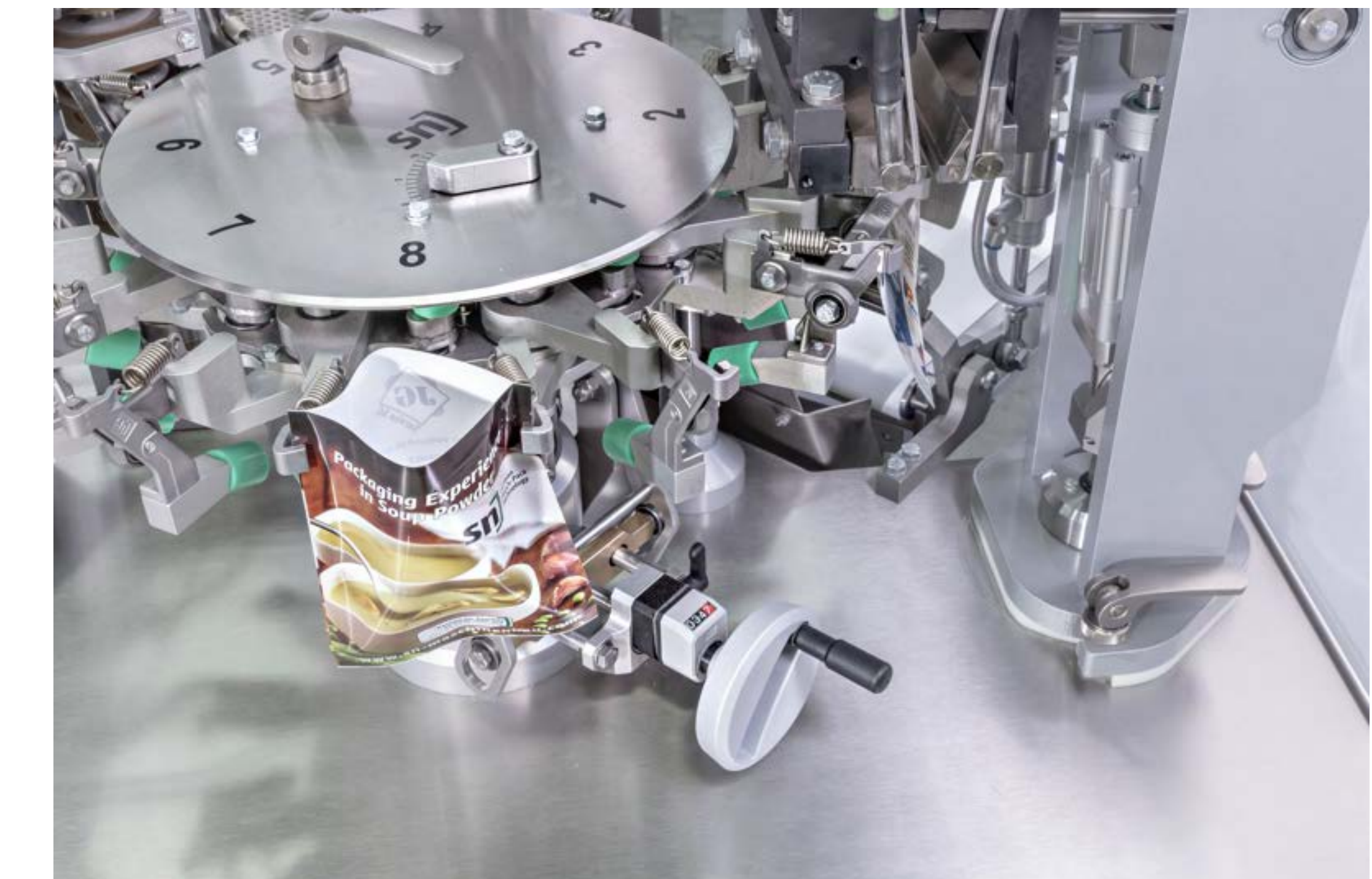
Central gripper adjustment (manual)