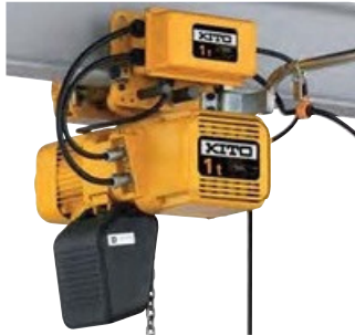
125kg to 20t