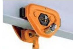
125kg to 3t