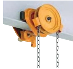
125kg to 3t