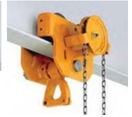
5t to 20t