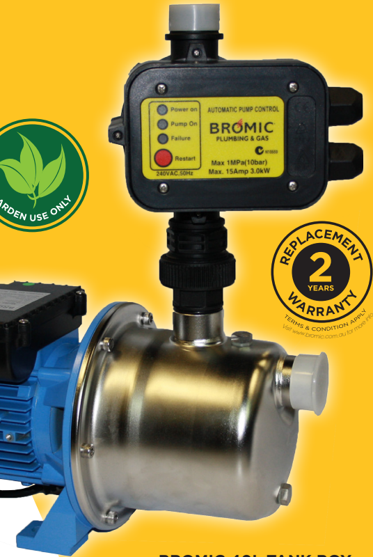
BROMIC 40L TANK BOY WITH CONTROLLER PART NO. 7575114