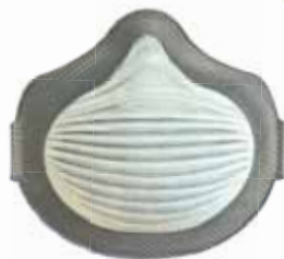
Soft Foam Full Flange