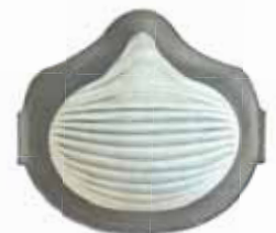
Soft Foam Full Flange

4800 Series Exclusive SmartStrap® plus Nuisance Organic Vapours 4800 P2 Medium/Large