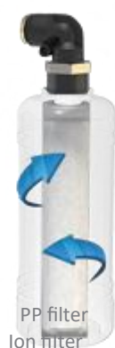
PP filter Ion filter

The first stage adopts PP cotton to filter out impurities and prevents laser blockages.