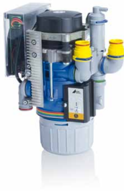
CAS 1 Combi Separator