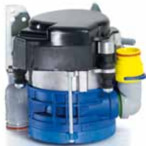
CS 1 Combi Sepamatic

tested separation efficiency of around 98%. Optionally, an additional rinsing system can be connected up to both appliances. This makes the entire system work in an even more hygienic manner, since the constant film of water prevents the deposit of particles and the coagulation of blood. Both the CS 1 Combi Sepamatic and the CAS 1 Combi Separator are compatible with a large number of treatment units and are integrated ex factory as standard by leading manufacturers.