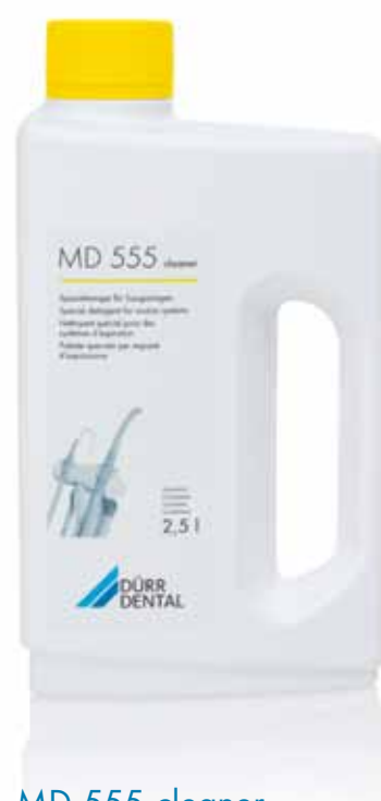
MD 555 cleaner Special cleaner

Foam-free concentrate for all suction units and amalgam separators.