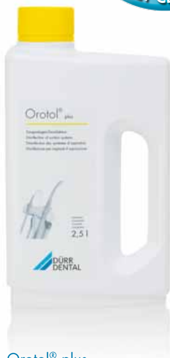
Orotol® plus Suction unit disinfection

Foam-free concentrate for the disinfection, deodorization, cleaning, and care of all suction units and amalgam separators.