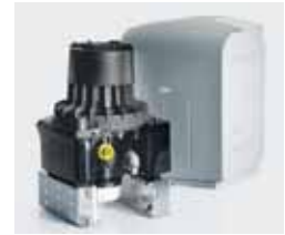
VSA 300 S – the first suction unit to incorporate both a separation system and an amalgam separator