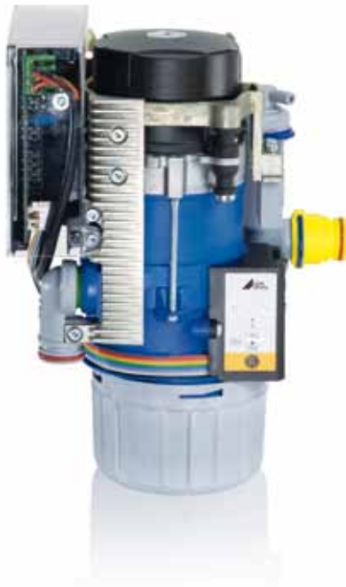
CA 1 Amalgam Separator