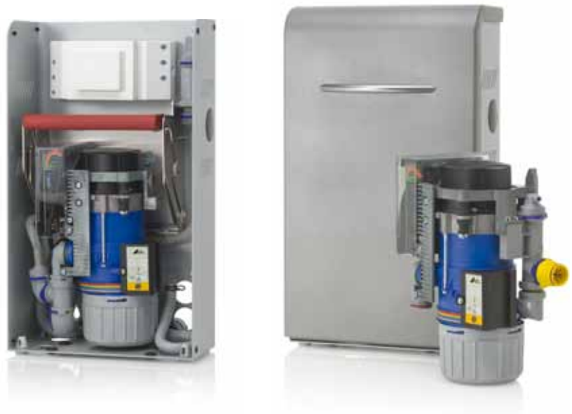
Quiet running in a housing that is ideal for dental practices

With a proven separation efficiency of around 98% and a robust design, it is quite similar to the CAS 1 Combi Separator. The integrated float monitor reliably detects the water level and regulates the CA 1 if required.