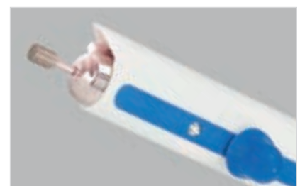
HANDPIECE WITH LIGHT