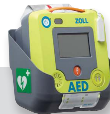
Universal Wall Mount with ZOLL AED 3 alone (without carry bag) Part# 8000-001255

The Universal Wall Mount holds the ZOLL AED 3 alone or in its carry case and is labeled with the green ILCOR AED symbol. It includes mounting hardware, consumable tracking card, wall-mount template, and installation instructions.