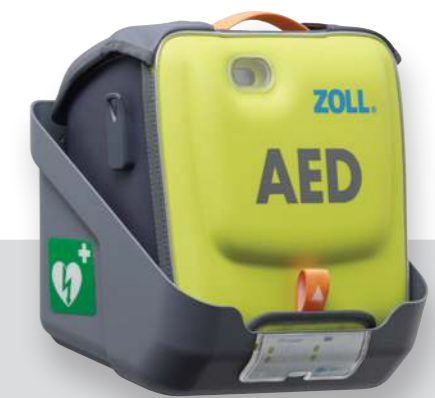
Universal Wall Mount with ZOLL AED 3, carry case, and backup CPR Uni-padz (in carry case) Part# 8000-001266