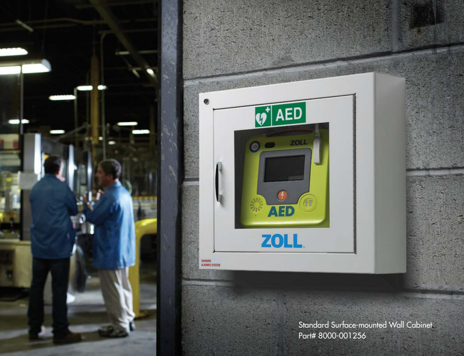
Standard Surface-mounted Wall Cabinet Part# 8000-001256