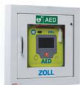
Semirecessed Wall Cabinet Part# 8000-001257

easy installation or the semirecessed or fully recessed models for less intrusive storage. All three models include an ILCOR (International Liaison Committee on Resuscitation) AED label set and installation instructions.