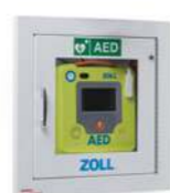
Fully Recessed Wall Cabinet Part# 8000-001258