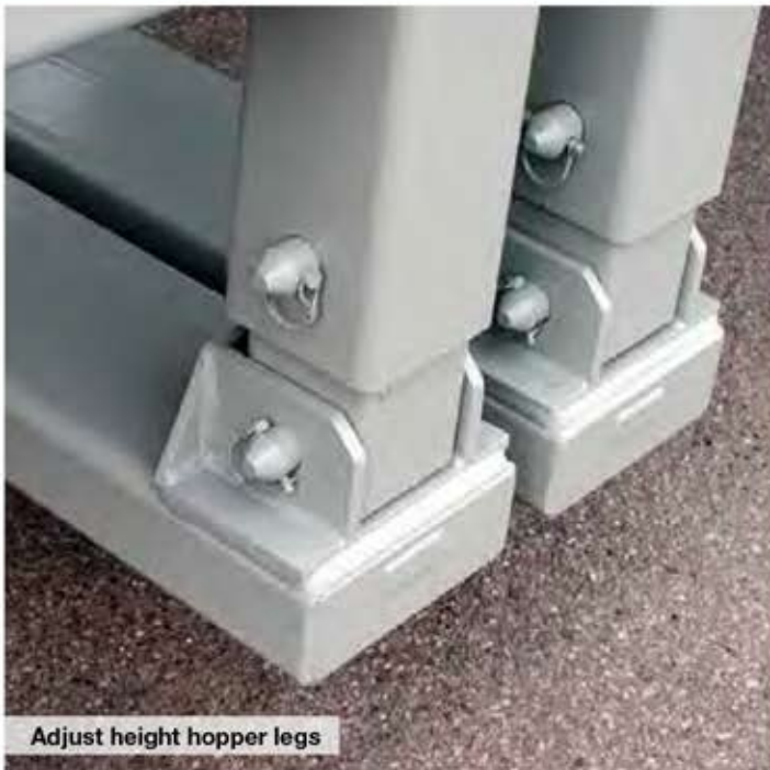
Adjust height hopper legs