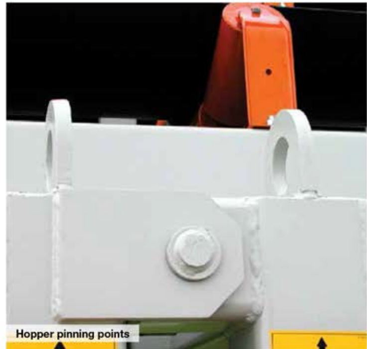
Hopper pinning points