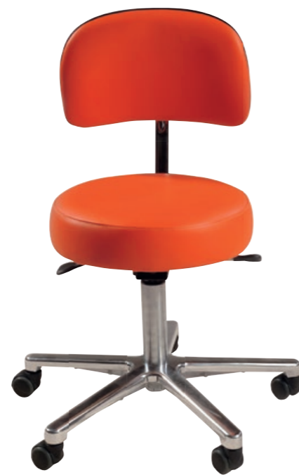
F1 Classic stool