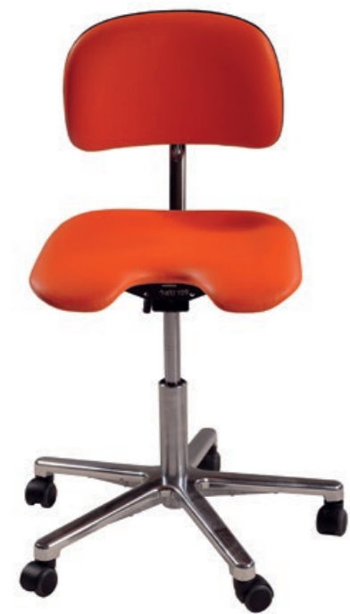
F1 Dental stool