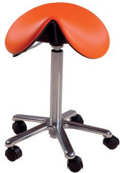
F1 Ponychair saddle stool