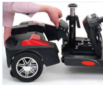
Splits easily in seconds.