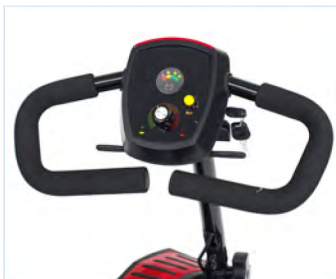
Delta Bars as standard.