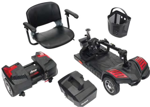
Splits easily for storage and transportation.