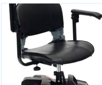
360° swivelling seat.