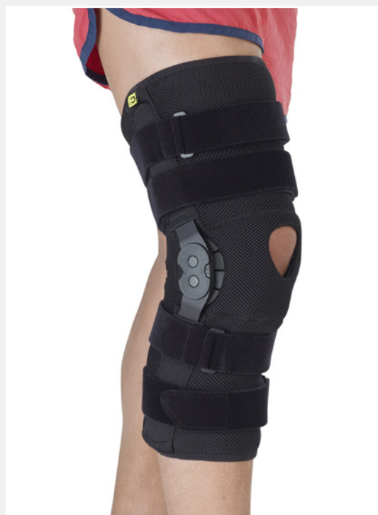
The Active X Long anterior closure hinged knee brace.