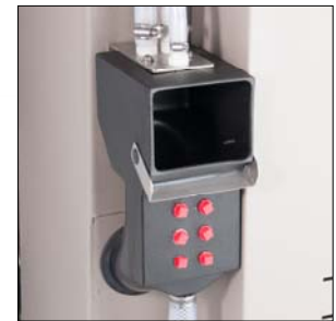
Safe chemical injection