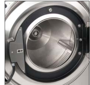
Superior cylinder design