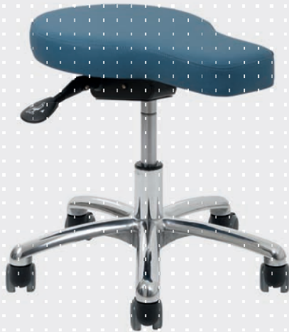
VELA Samba 530