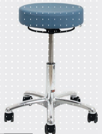
VELA Samba 500