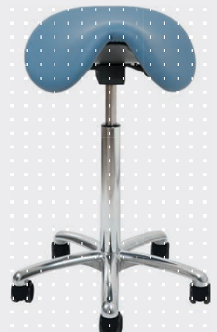
VELA Samba 400