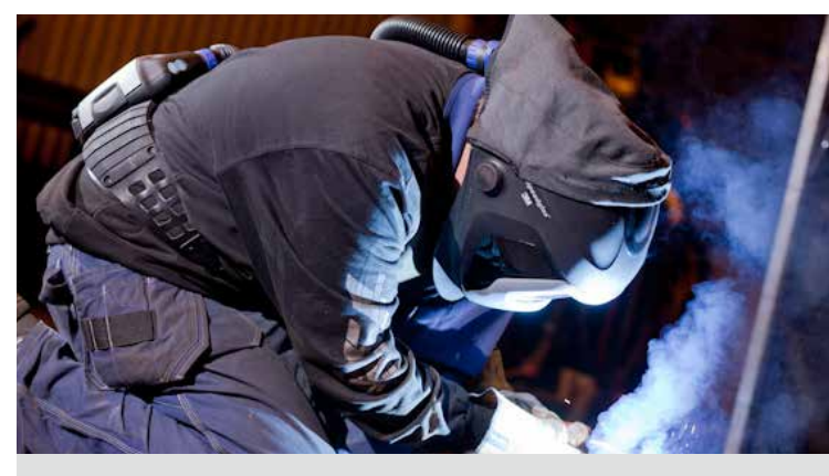
Extended protection: A flame-resistant headcover (used in this application) and ear/neck protection are available as accessories to all Speedglas 9100 series welding helmets.

Airflow: The middle channel keeps the welding lens fogfree, while two side channels provide smoothly delivered air to your nose and mouth.