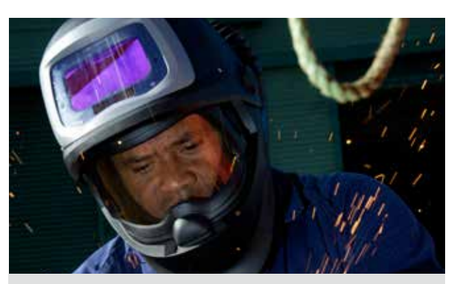
A spark and spatter-resistant head cover is included as standard in all 9100 FX & FX Air series welding helmets. An optional extended-length head cover and ear/neck protection are available as accessories.

The award winning 9100 FX flip-up welding helmet is perfectly balanced both in ergonomics and functionality. The balanced combination of welding helmet and grinding visor that sits perfectly balanced for a comfortable all-day wear.