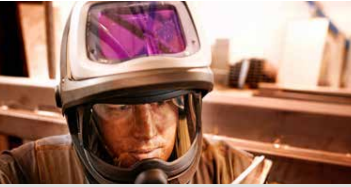
A quick lift of the silver front and you get a clear, big, 170 x 100 mm view — perfect for precision grinding in low light conditions, while maintaining your respiratory protection.

To achieve a higher level of respiratory protection, air is supplied directly to the breathing zone. A diffuser broadens and reduces the speed of the airflow for your maximum comfort.