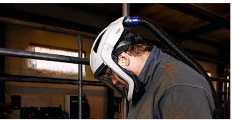
Available as a respiratory protection faceshield with high impact visor or alternately, respiratory protection faceshield with high impact visor and Type 1 industrial safety helmet.