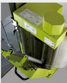
▲ No-Thread Film Carriage