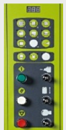
▲ Control Panel