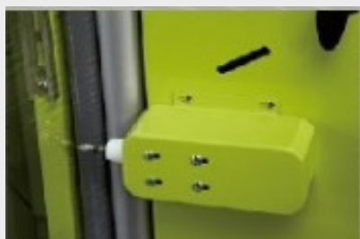
▲ Pre-stretch Ratio Selection