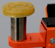
Screw Pad / 4WD Adapter