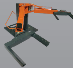
Tyre Holder Adapter