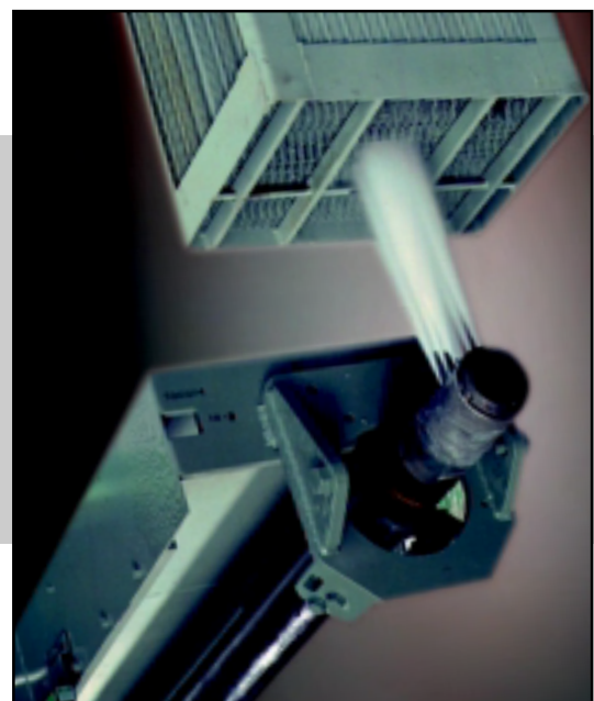
IK-525-DM in high pressure waterwash mode. The air heater cleaner can be mounted vertically (for blowing left or right) or horizontally (for blowing up or down).

Introduced in 1967, the original IK-525 sootblower has long demonstrated its effectiveness and reliability in multiple-cleaning applications. The IK-525 is the platform for the IK-525-DM Air Heater Cleaner. Today's IK-525 design is a product of more than 30 years of proven success.