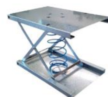
Coil Spring Base w/ galvanised top