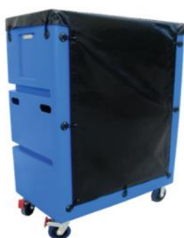
TLET1 with PVC Cover

These L.E.T. are made to order with a number of models available with different configurations to suit different uses. If you have a specifications requirement please contact customer service.