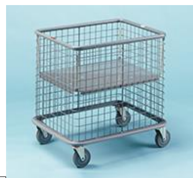
KH550B—Wet & Dry Trolley with Spring Base