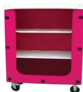
TLET1 with Poly shelves for Linen Storage

LINEN EXCHANGE TROLLEY— TALLBOY #1 W/ 2 POLYSHELF & GAL BASE PLATE AND 15CM WHEELS #115 X 64 X 170CM (EACH) RTP-LET1-SET1