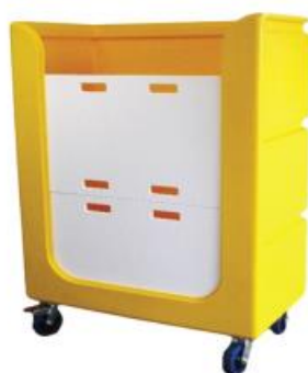
TLET1 with Shelves to form bulk collection