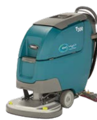
Dual disk: 600 mm