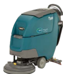
Single disk: 500 mm

The T300 scrubbers have multiple machine head types to fit your cleaning applications and optimise cleaning performance for specific areas.