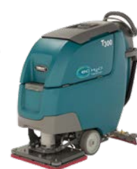
Orbital: 500 mm