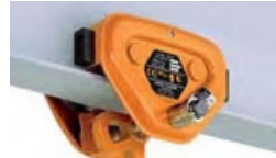
125kg to 3t