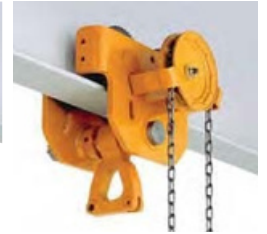
5t to 20t