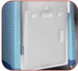
Cardiac Board Emergency - Pediatric