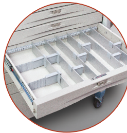
Drawer Flex Dividers