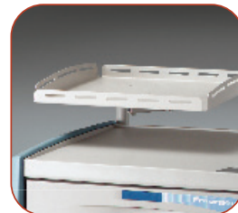
Defibrillator Shelf Emergency - Pediatric