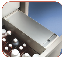
Internal Lock Box Emergency