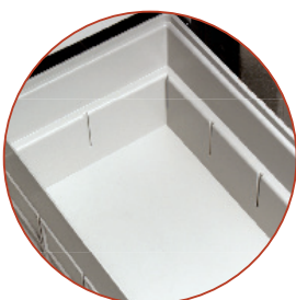
Seamless Drawer Trays are durable and prevent issues associated with pop rivets or sharp edges found in metal drawers

The Avalo Series Procedure Cart offers a wide selection of organization accessories, large capacity, and a choice of models in 4-drawer, 5-drawer, or custom configurations. The Avalo Procedure Cart is adaptable to many different healthcare applications including trauma, airway, dressing, cast, or general supply cart. Ensure security with a choice of three (3) proven lock systems including an advanced keyless entry with auto-relock.