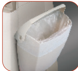
Waste Container Isolation - Procedure