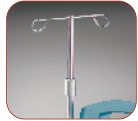
I.V. Pole Emergency - Pediatric