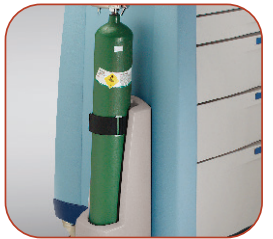
Oxygen Tank Holder Emergency - Pediatric