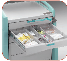
Divided Drawer Tray Emergency - Pediatric - Procedure