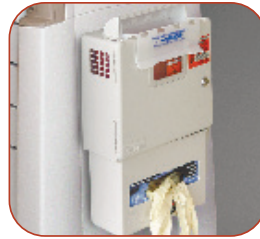
Sharps/Glove Holder Anesthesia - Isolation - Procedure