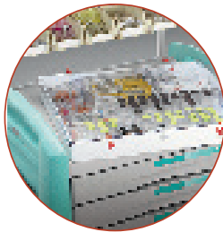
Removable Drawer Trays