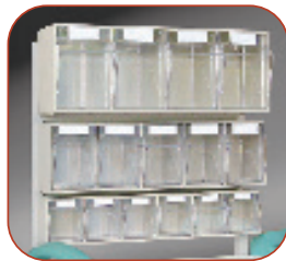
Tilt Bin Organizers Anesthesia