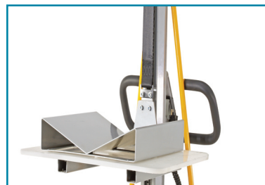
V Block Attachment (v2202)