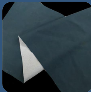
3. Waterproof overlay