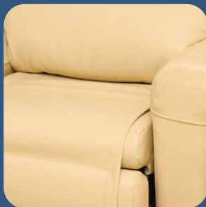
1. Extra covers