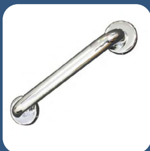
6. Hand rails