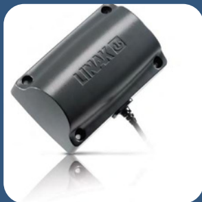
2. Inbuilt massage function