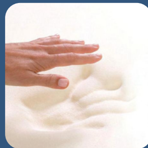
4. Pressure prevention seating/overlay