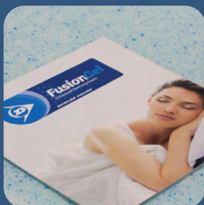
5. Gel fusion seating/overlay