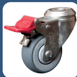
8. Hospital wheels