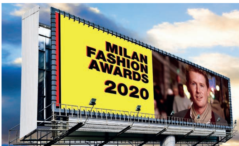
Outdoor communication – vinyl