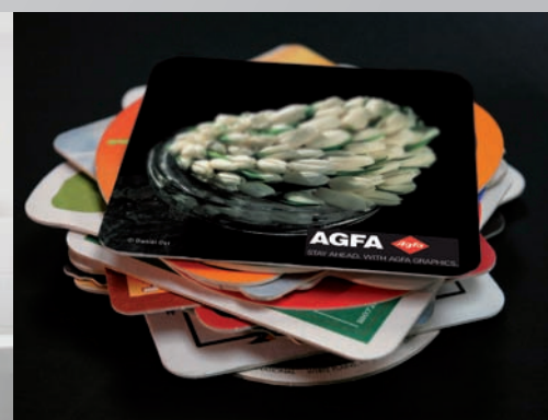
Object printing – cardboard