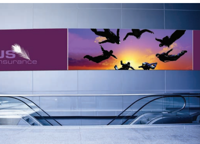
In-store communication – forex