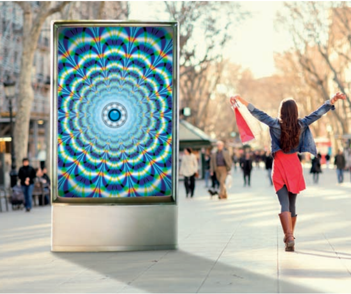
Outstanding print quality on backlit applications

The wide-format hybrid Anapurna i LED-series is a perfect fit for sign shops, digital printers, photo labs and mid-size graphic screen printers that want to combine board and roll-to-roll print jobs. The engines print at a width up to 3.2 m and combine excellent quality with high productivity for outdoor and indoor jobs. The hybrid Anapurna's are equipped with UV LED lamps, enabling you to print on a wider media mix and to save energy, costs and time. The white ink function creates possibilities for printing on transparent material for backlit applications or for printing white as a spot color. With the optional automatic board feeder, productivity is increased even more.