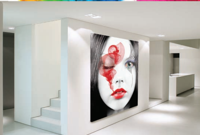
In-house decoration – dibond