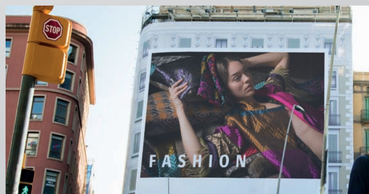
Outdoor communication – vinyl