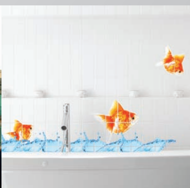
In-house decoration – tiles