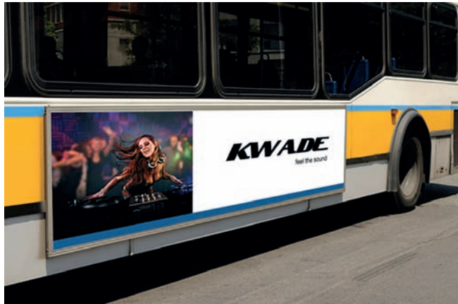
Outdoor communication – vinyl

As a highly-advanced printer powered by Asanti, the hybrid Anapurna LEDs integrate perfectly with PrintSphere, Agfa Graphics' cloud-based service for production automation, easy file sharing and safe data storage. This integrable cloud service offers a standardized way for print service providers to automate their workflows and facilitate data exchange with customers, colleagues, freelancers, other departments and other Agfa solutions.