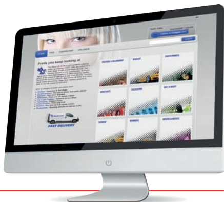
StoreFront web-to-print software